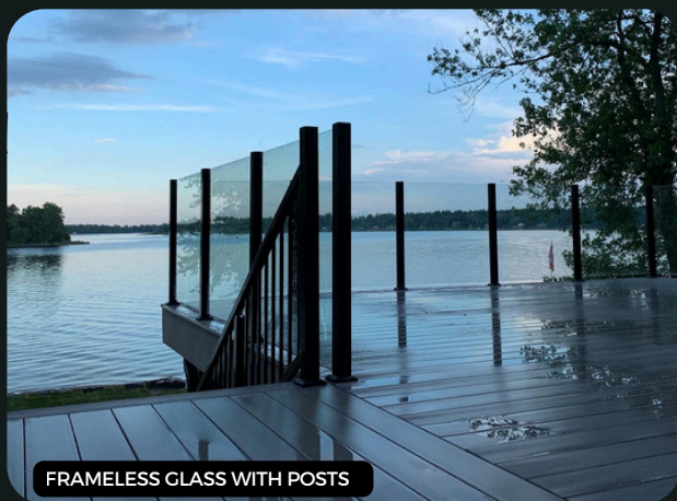
FRAMELESS GLASS WITH POSTS