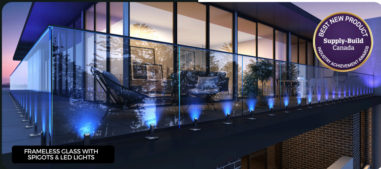
FRAMELESS GLASS WITH SPIGOTS & LED LIGHTS