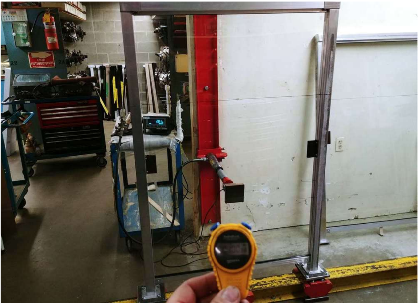
Test: Individual Elements