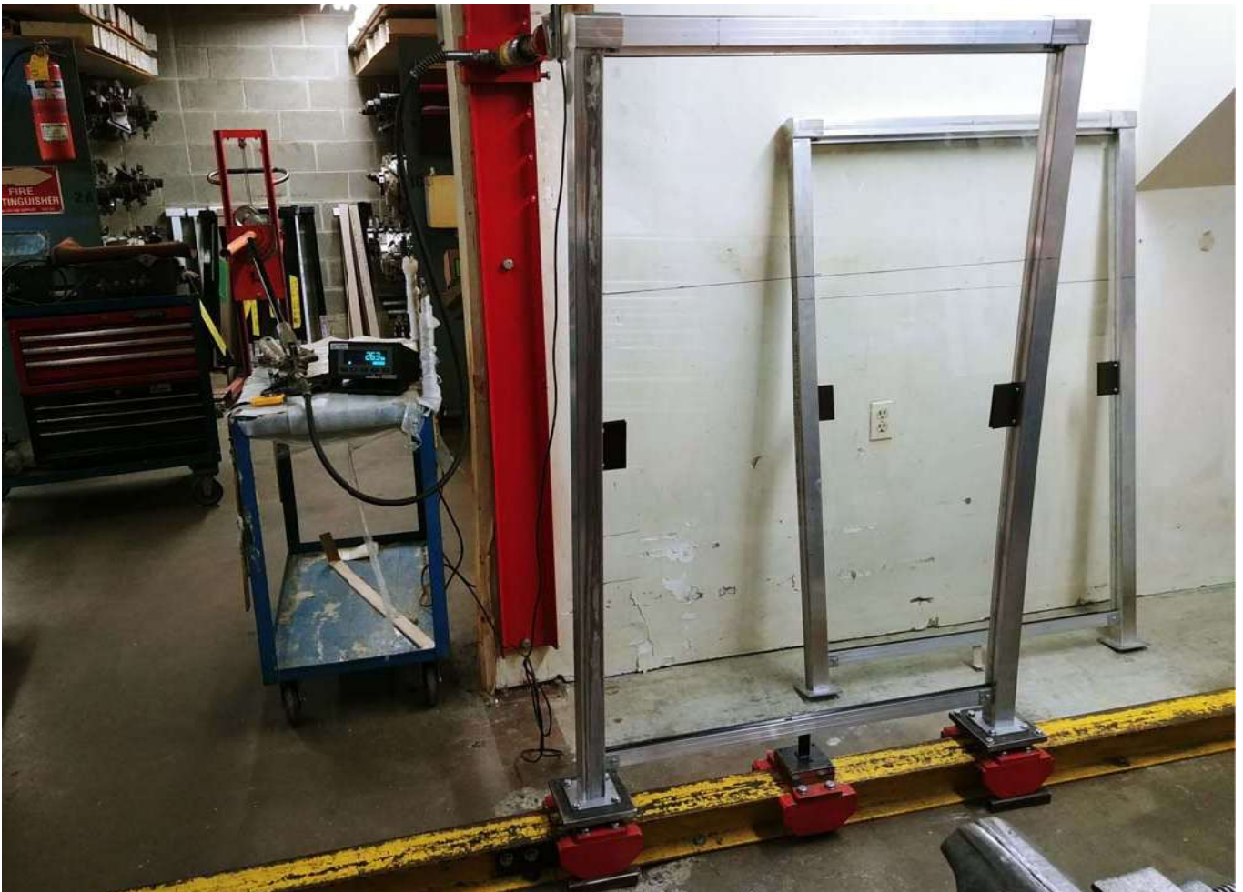
Test: Top Of Post Concentrated Load