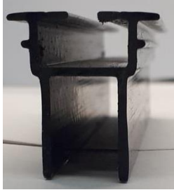
Bottom Channel Gasket